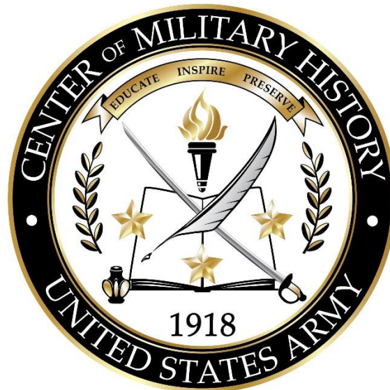
The center's logo.

After Halder surrendered to the US Army, the United States refused to try him at Nuremberg. Instead, he faced only a minor trial for “aiding the Nazi regime” in a German court. He denied any knowledge of the crimes which bore his literal signature and was found not guilty. After the war, he lived a comfortable life as an author, commentator, and “historical consultant” for the US Army Center of Military History .