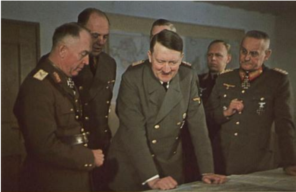
Franz Halder (right) at a planning meeting with Adolf Hitler, Alfred Jodl and Ion Antonescu. 1942.

One of the first and most important of these historians was not a historian at all.