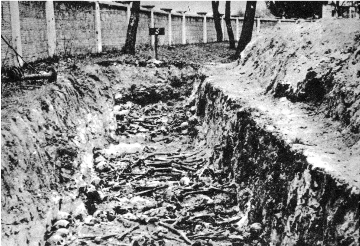
A mass grave of Red Army soldiers, executed on orders from Franz Halder at Stalag 307 near Dęblin, Poland.

“It is necessary to eliminate the red subhumans, along with their Kremlin dictators. The German people will have to complete the greatest task in their history, and the world will hear that this task will be completed to the end “- Wehrmacht Messages for the troops, № 112, June 1941