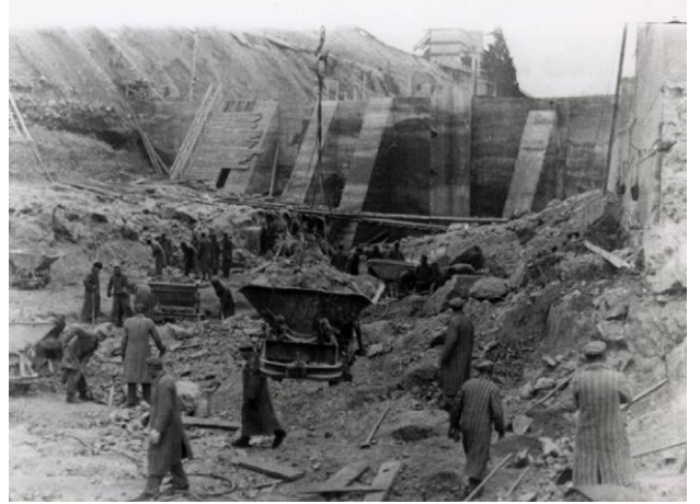
Slaves building a power plant for Steyr-Daimler-Puch at Mauthausen.