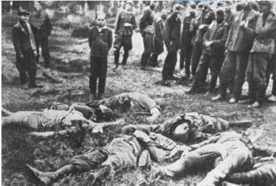
A boy forced to pose with the corpses of his family before his execution by the Wehrmacht, Zborov, Ukraine, 1941.

All in all, a minimum of 20 million Soviet civilians were exterminated by the Nazis, but some Russian scholars estimate that the true number is at least double that .