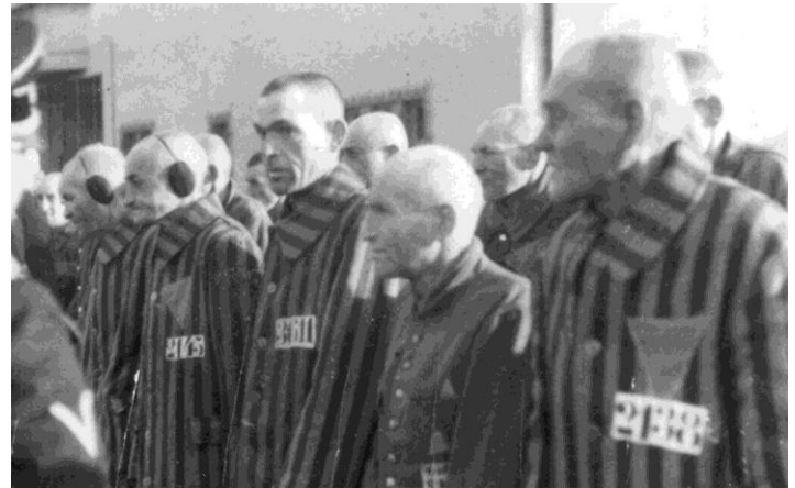
Slaves at a Continental rubber factory.

The Nazis needed more than just food to conquer the world. They also needed weapons and equipment. For this, Germany mustered its world-famous industrial might. The infamous concentration camps contained massive factory and labor complexes where millions of slaves were worked to death, building the weapons and equipment the Wehrmacht used to subjugate them. Given the magnitude of the contracts, very few German corporations kept their hands clean, and even the dirtiest kept all the blood money after the war.