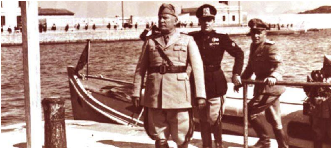
Lifelong fascist and future CIA agent, Propaganda Due grandmaster Licio Gelli (center) with Mussolini in 1941.

In recent years the end of the Cold War has brought revelations about the CIA's “ gladiators ” such as Yaroslav Stetsko and Licio Gelli influencing the world's political development by any means necessary. From Germany and Italy to Japan and South Korea, there is now a vast collection of evidence proving the existence of large, well-funded networks of fascist terrorists who did not hesitate to use violence to ensure compliance from the “free” people of the world.