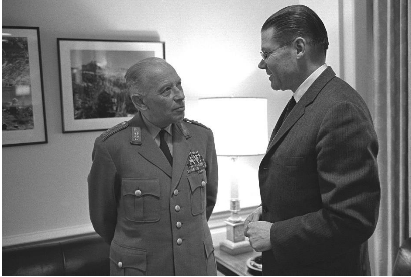
Heusinger meeting US Secretary of Defense Robert McNamara, 1964

Through manipulation, fabrication, and widespread censorship, Halder and Heusinger created a complete narrative of themselves and the Wehrmacht as brilliant, noble, and honorable victims of the madman Hitler rather than the monsters who butchered a continent.