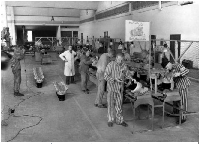
Slaves at a BMW factory in Dachau.